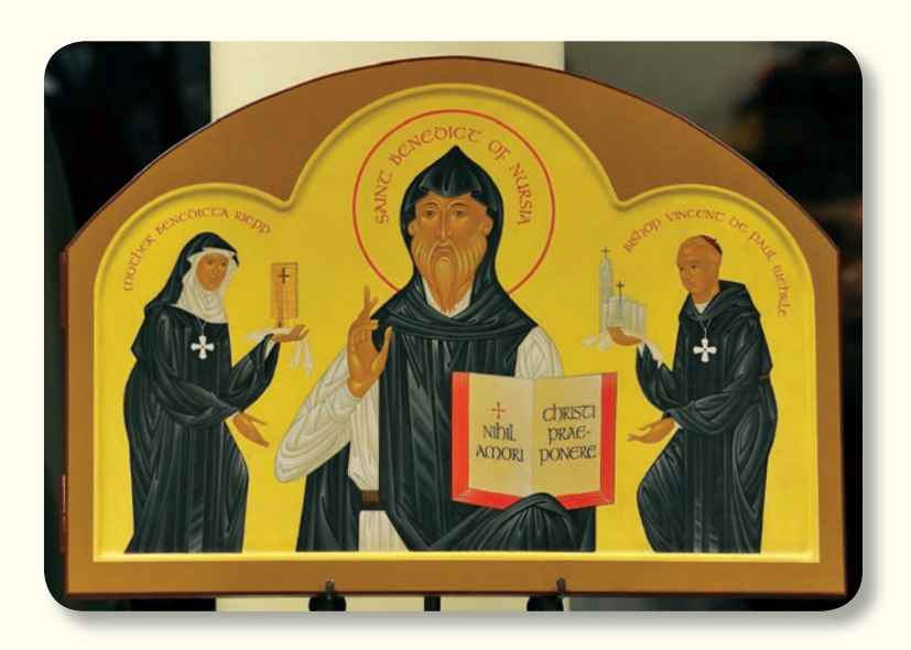
The icon was commissioned by the University of Mary for the Benedictine Sisters of Annunciation Monastery.

The icon was written on a traditional carved wood panel with braces, using materials such as marble dust, chalk and 24 karat gold. Actual stone fragments from the Cathedral were ground to create pigment and water from the Jordan River was used in the paint.